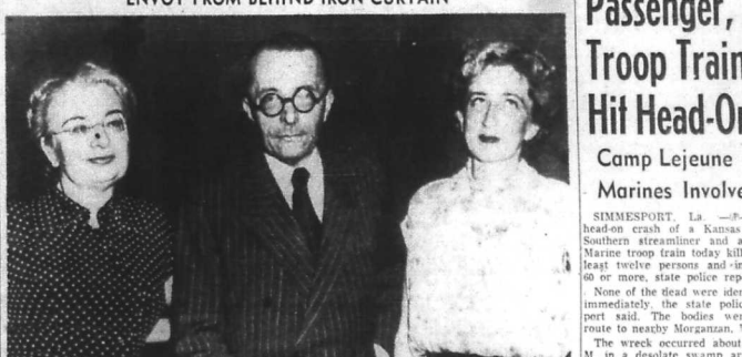
Dr. Condon Resigns Government Position