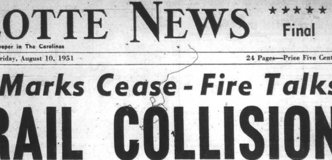
Passenger, Troop Trains Hit Head-On