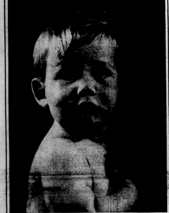
"Who me, boss? I never promised nothin' to nobody."