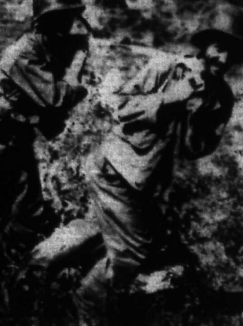
American troops are taking all precautions against body-trapped bodies.