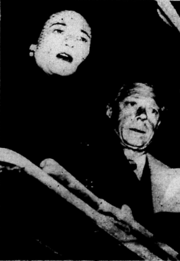
The Duchess of Windsor, accompanied by the Duke, warns newsmen of a switch engine coming up behind them during a stop-over at Chicago en route to Canada.