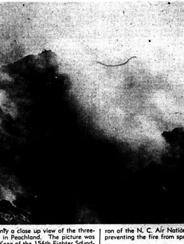
No volcano, this is only a close up view of the three-acre pile of sawdust fire in Peachland.