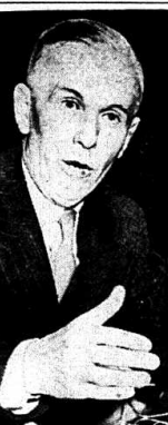
GEN. MARSHALL Raps Chinese Leadership

CHICAGO — (AP)—Over 31 million snow-covered roofs in the Northwest Airlines DC-4 passenger plane which crashed as it landed at the Municipal Airport last night, fled safely out of the burning plane.