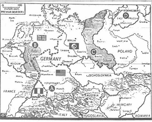
THE GEOGRAPHY OF SECRETARY BYRNES' SPEECH... U. S. Secretary of State James F. Byrnes, in a speech at Stuttgart, Germany (A), rejected France's claims to the Rhine-Ruhr (shaded B), and Poland's claim to Silesia and other German areas (shaded C) east of the Oder River.

WASHINGTON (AP)—The newspaper Chinese Warfare said today a Chinese soldier was shot by a 30-year-old Chinese high school student who was in the front lines of the war.