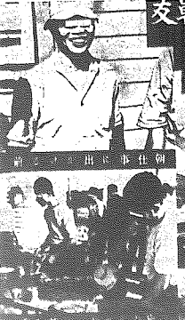
At left is reproduced a surrender pass dropped behind the Jap lines...