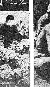
Not even Japanese in all pictures are marked out in order to protect their families from reprisals.