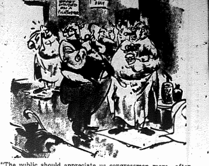
"The public should appreciate us congressmen more—after all, we really make mistakes only for future generations to profit by."

Last evening in Charlotte, as I boarded the bus for Caffeine, a man about 20 years old, fairly well clothed, pushed a woman ahead of me, pushing me roughly back. I was sure he was a male.