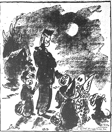
My brother used to be an Army demolition expert, fellows! He'll give us a short briefing before we start out tonight.

General Shabalin's estimate of the situation in Germany... The Russian general expressed great amazement at the ingenuity of General Draper.