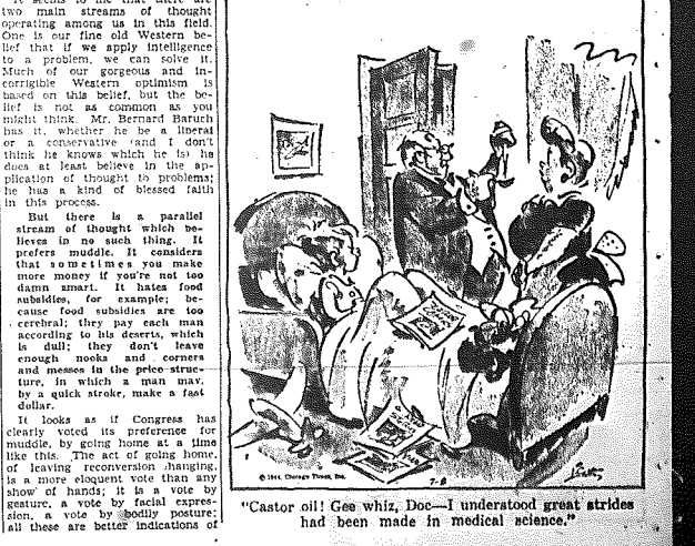
"Castor oil! Gosh whiz, Doc—I understood great strides had been made in medical science!"