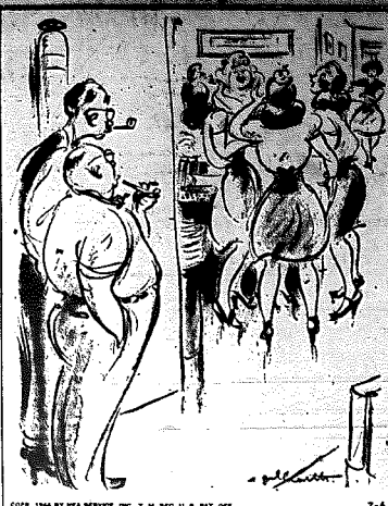
Something about that huddle reminds me of the old days when one of our men came in off the road with a brand-new story!

NEW YORK (AP)—We are now entering the period of integration of the anti-Nazi forces. The Nazi armies are breaking into fragments, each one as