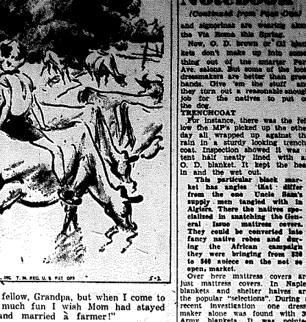
"Oh, Pops a fine fellow, Grandpa, but when I come to visit you it's so much fun I wish Mom had stayed here and married a farmer!"