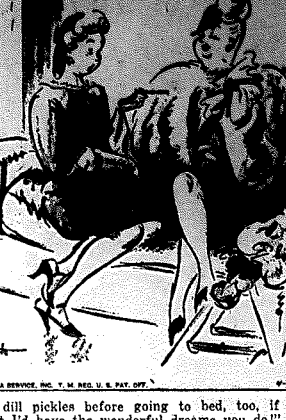
COM. 1944 BY THE BUREAU OF THE NEWS, INC. P. 50, P. 60.