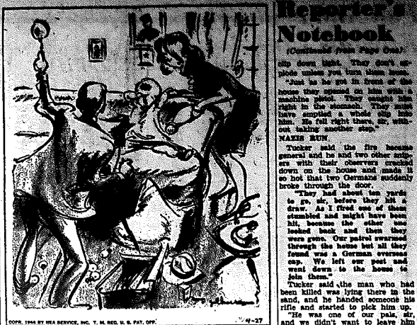
"Is that any way for daddy's pin-up girl to act?"