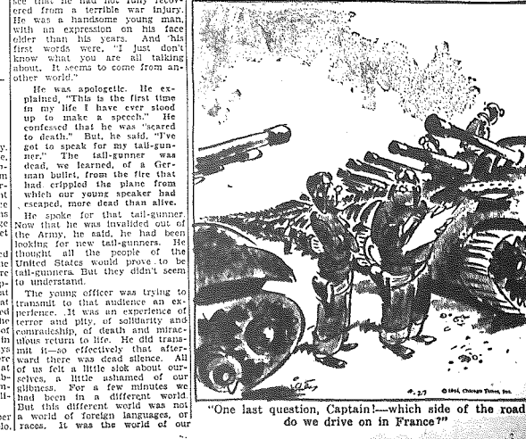
"One last question, Captain—which side of the road do we drive on in France?"