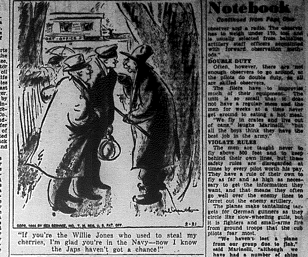
Illustration by [Name] showing a man in military uniform.