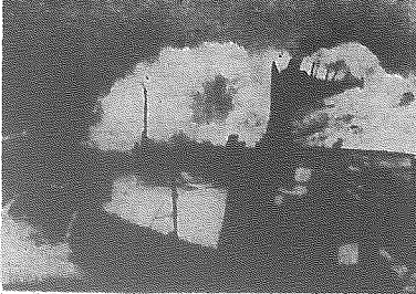
— BREAKWATER MADE OF 23 SUNKEN SHIPS BEING USED AS A HARBOR FOR THE REHABILITATION OF FRANCE, CAN BE SEEN ON THE COMING OF THE "MULBERRY" PORTABLE HARBOUR.