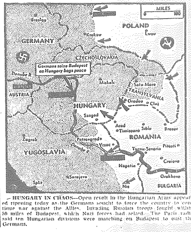
HUNGARY IN CHAOS—Open revolt in the Hungarian Army against German efforts to force continuance of the war against the Allies, involving Russian troops fought within 50 miles of Budapest, which Nazi forces had seized. The Paris radio said ten Hungarian divisions were marching on Budapest to oust the Germans.