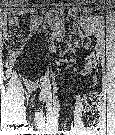
By Dorman Smith

I am willing to admit that we all have to become less opinion-prone as we grow older. I am willing to admit that we all have to become less opinion-prone as we grow older. I am willing to admit that we all have to become less opinion-prone as we grow older.