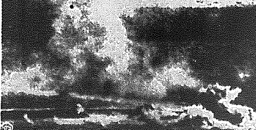
Red Star aircraft from the Soviet Union is seen in flight over the front lines in the Ukraine.