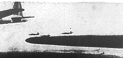
END OF A U.S. BOMBING RAID IN TUNISIA—American Flying Fortresses speeding from home, leaving in the background the Mediterranean and smoke columns rising from bombed planes and fuel dumps at the Nazi-held El Aouina airport north of Tunis in Tunisia.