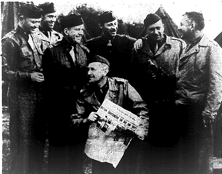
THEY READ THE NEWS—First picture of Charlotte's medical evacuation unit, now stationed somewhere in England, came in the mail today from NEA, exclusively in Charlotte to The Charlotte News...