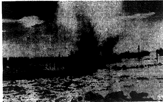
MARINES PRACTICED FOR SOLOMONS—U. S. Marines prepared for the present attack on the Solomon Islands by simulating an attack on another South Sea Island.