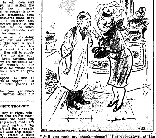
"Will you cash my check, please? I'm overdrawn at the bank so I can't cash it here."