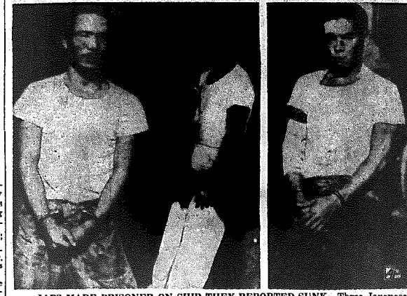
JAPS MADE PRISONER ON SHIP THEY REPORTED SUNK—Three Japanese prisoners, captured from a patrol boat during the recent United States task force attack on Wake Island, glow at their captors from the deck of an American aircraft carrier in this photo just released by the Navy.

LONDON.—(AP)—More than 1,000 German soldiers and civilians are "fully engaged in defense" against the British offensive in the "Battle of the Java Sea," the Air Ministry News Service said today.