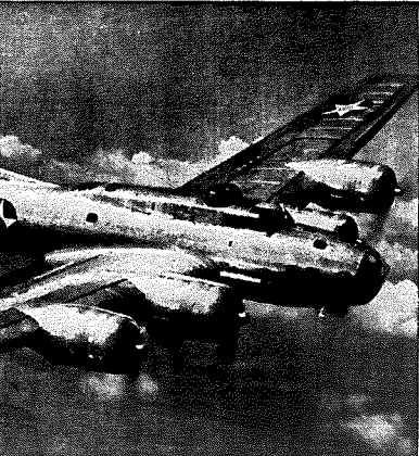
STRIKE FOR UNCLE SAM—Three United States Army B-17's (Flying Fortresses) led on the American bombers in a dramatic attack on Japanese forces in the Philippines...