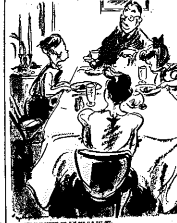
"When food rationing gets started, Dad, will they cut down on the things children don't like but have to eat because it's good for them?"