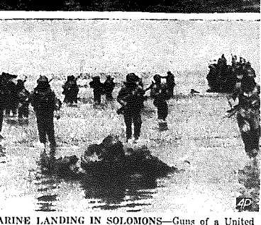
NAVY GUNS COVER MARINE LANDING IN SOLOMONS—Guns of a United States naval destroyer (top) flash out against a gray sky as they plaster Japanese artillery positions to cover the landing of U. S. Marines in the Solomon Islands.

WASHINGTON.—(AP)—President Roosevelt disclosed today that the Administration, in the light of battle experience, was cutting down on the volume of tanks and planes so far as their number is concerned, to emphasize greater power and strength.